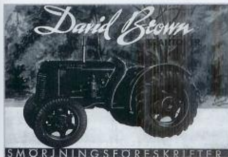
Cropmaster (Swedish) Publication number: N/A Date: circa 1948 Number of pages: 4 Rarity: 6

Our guide, where possible, gives the publication number and date of the actual brochure shown. There are variations on different print runs and issues, so the same brochure may have several different dates. The page numbers show the actual number of printed sides; for example, a single sheet leaflet will be recorded as 2 pages. Our rarity guide works on a scale of 1 to 6, with 1 being common and 6 being very rare.