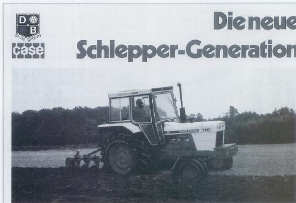
Range (Germany) Publication number: N/A Date: circa 1978 Number of pages: fold-out Rarity: 4